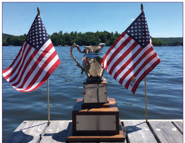
July 4th Boat Parade trophy