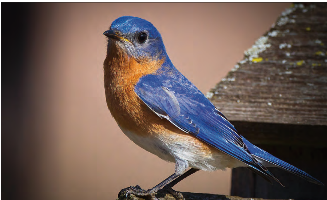
Eastern bluebird (sialia sialis) that nests on Copake Country Club golf course birdhouses.