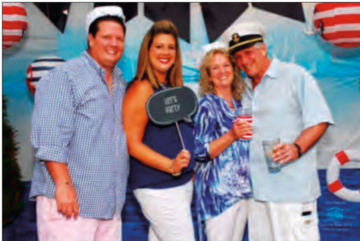
Summer Bash 2016!