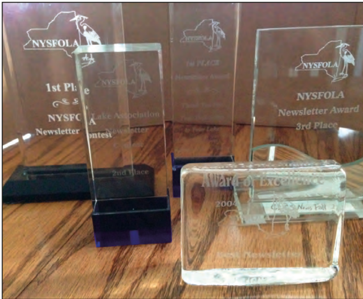
"CLCS News" awards from NYFOLA