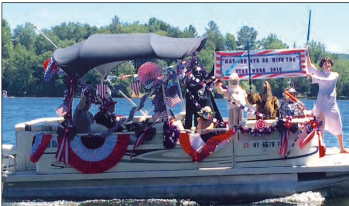
July 4th Boat Parade