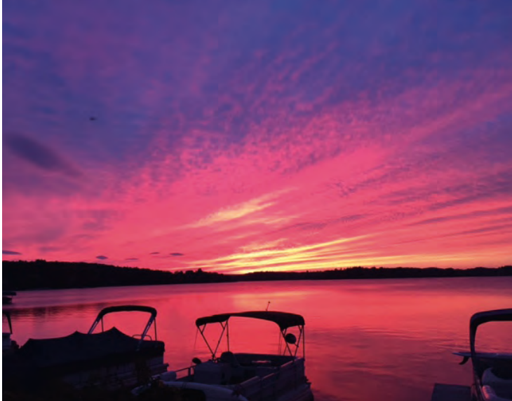
July sunset over Copake Lake

VISIT OUR WEBSITE AT: www.copakelakecs.org