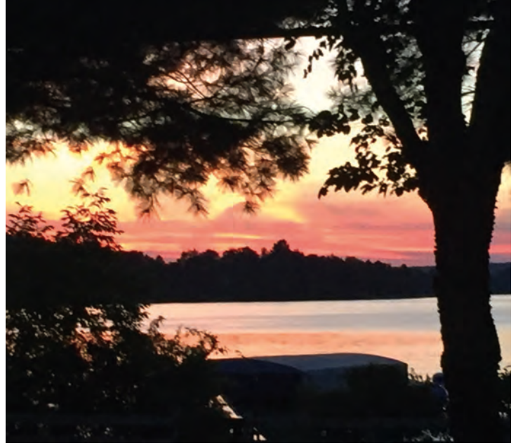
Late summer sunset from County Route 7.