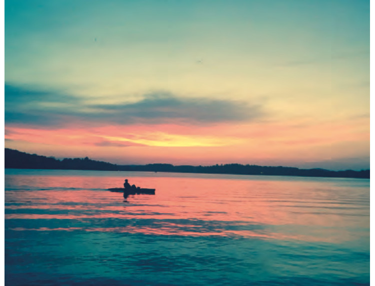
August sunset over Copake Lake